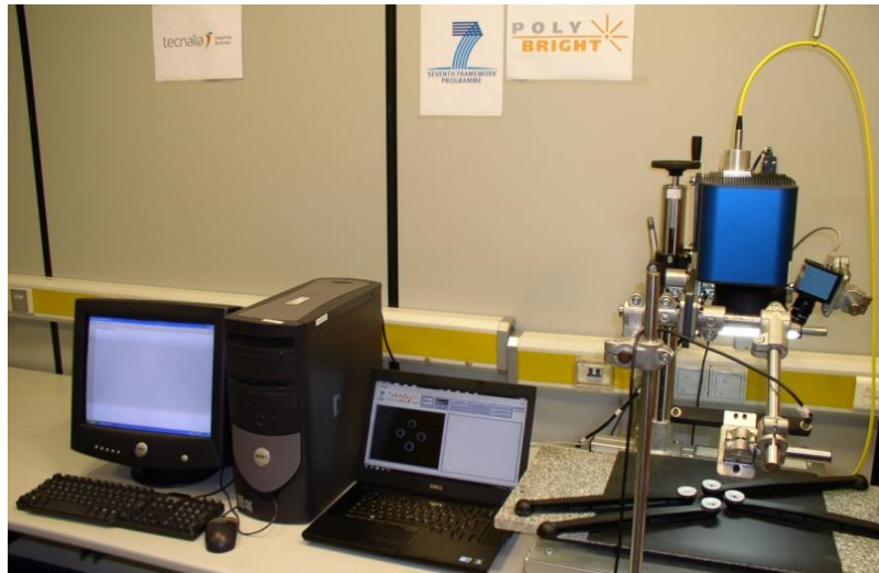
Figure 4: General view of the functional prototype.

For any further questions our expert will be pleased to provide you assistance: