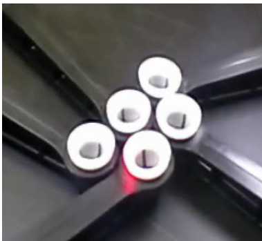
Figure 1: Simulating polymer welds at five arbitrarily arranged white rings with a red laser pointer.