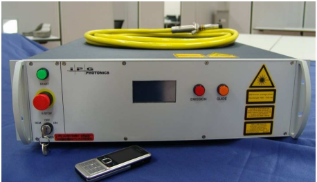
Figure 2: Prototype fiber laser system emitting at \lambda =1567nm